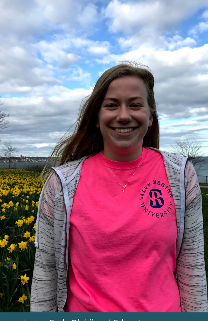
Major: Early Childhood Education Graduation Year: 2019